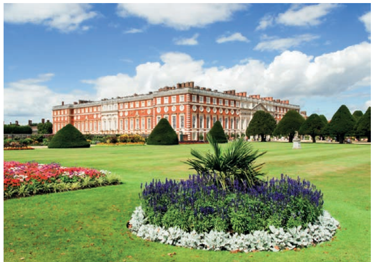
Hampton Court Palace

Situated only 15 minutes from the historic Hampton Court Palace and Bushy Park, as well as having two golf courses on the doorstep, you will find plenty to do at Jubilee Meadows.